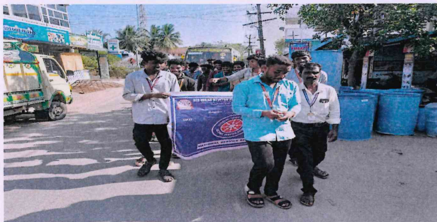
Plastic free environment Awareness Camp velankanni, Nagapattinam District