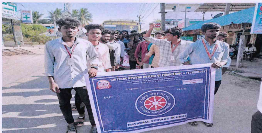
Plastic free environment Awareness Camp velankanni, Nagapattinam District