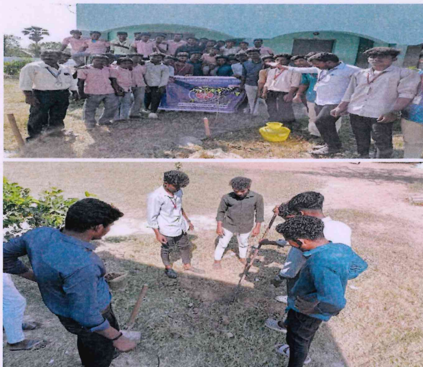
Save Tree Plantation Programme, Keliyur, Nagapattinam District